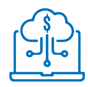
Unique Realtime connected financial management