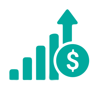
Low cost robust platform helps increase revenue & profitability