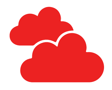
Web based comprehensive #NextBusinessERP